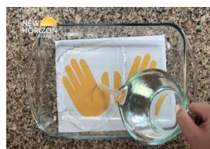
Pepper Germ Handwashing Experiment